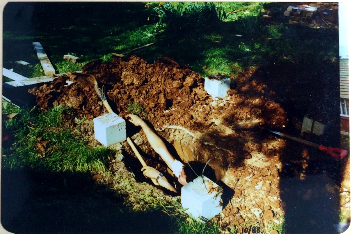
October 1988 The long drop for the toilet being dug.