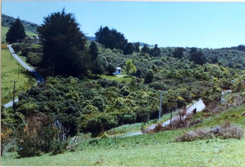
December 1980 The southern end of Moores Bush prior to the removal of the entrance macrocarpa trees and the demolition of the cottage. The shading shelter belt that ran to the right from the Thomson farm building, has been felled. The bush canopy in the foreground would be nearly 3m higher today