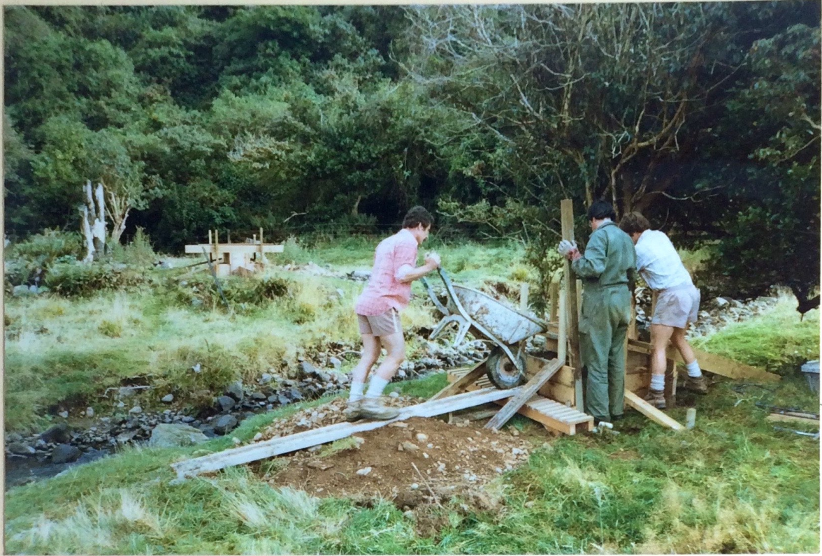
April 1982 The foot bridge over the Leith that wasn't to be. The concrete abutments being poured some 50m from the road. No further work took place as the Moores Bush funding 'vanished' somewhere into Forest and Bird general funds. without general approval. We soon had a new treasurer.