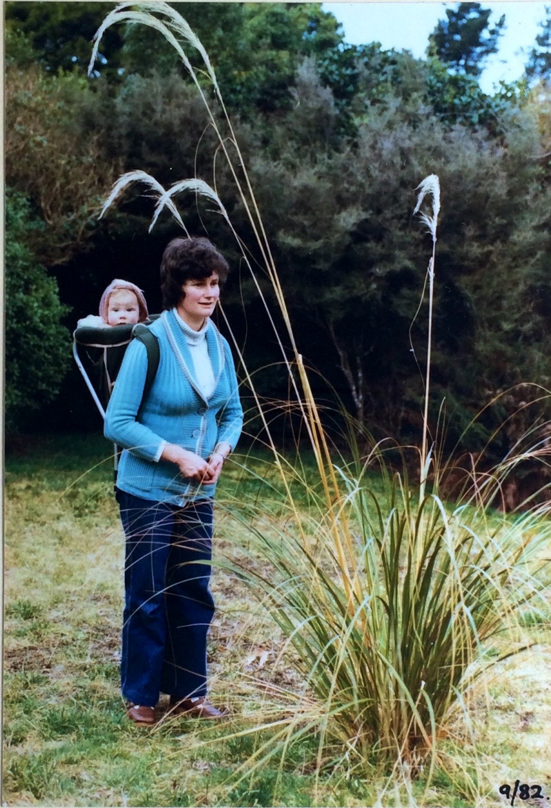
Photo taken September 1982