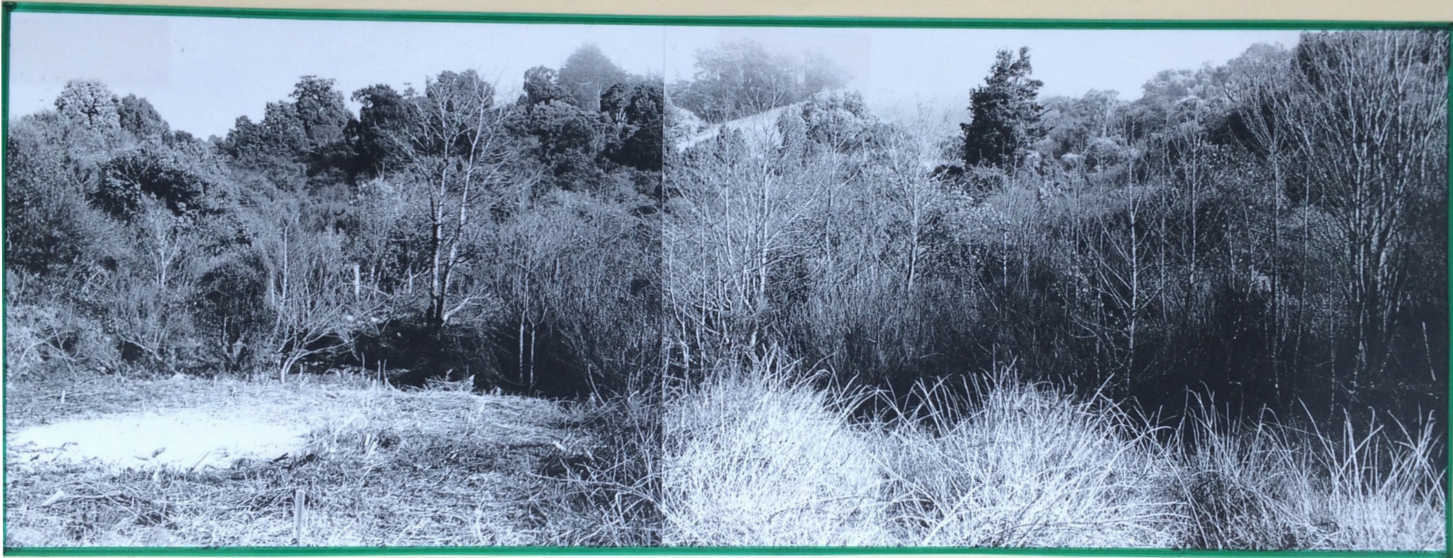
August 1977. Clearing the sizable areas of sycamore, broom, and blackberry on the north end flats. Sadly this area had got away on the Moores as age took its toll.