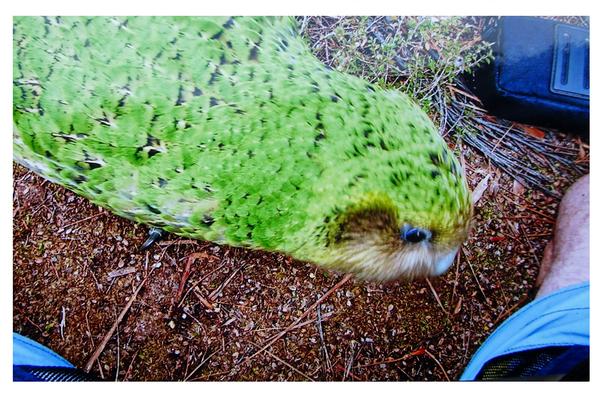
Gulliver had me on my knees to play. KDM