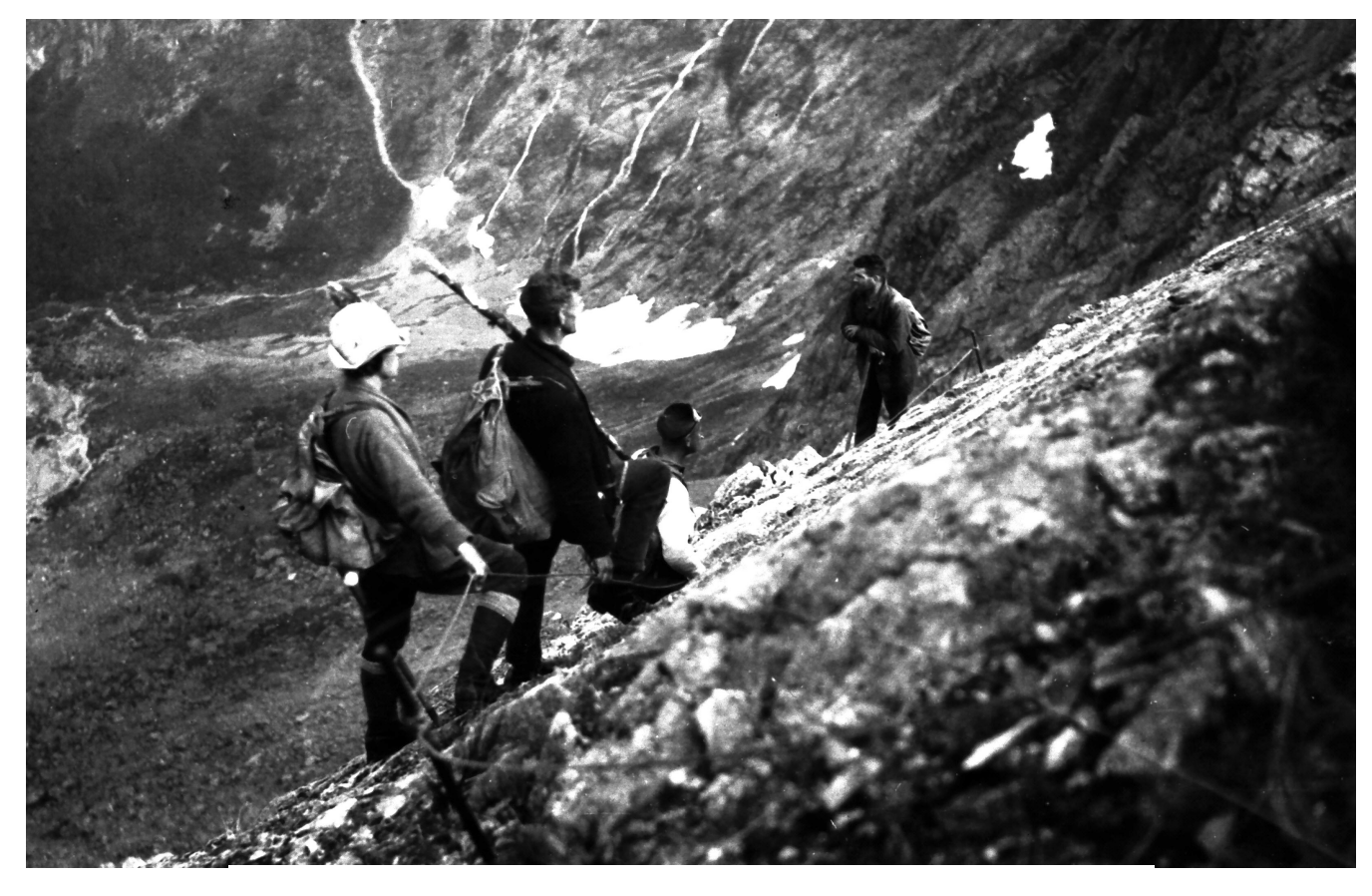
The Esperance 'ledges' are hairy even with a fixed hand-line.

At the time I was wishing that I was in the nearby Tutoko Valley where the Wildlife Service had just found a handful of male kakapo. Little did we know that a lonely kakapo probably saw us camping in the remains of McPherson Hut. In 1975 Richard Henry Kakapo was captured near here.