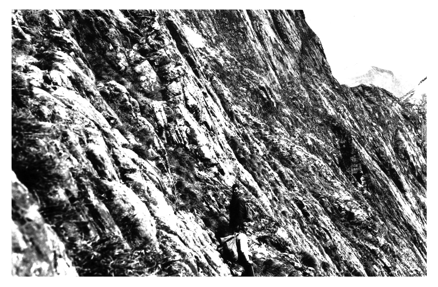
Spot, if you can, the traverse to the right. Miss CM Lucas Collection 1929

From the northern extent of the ledges. BJM